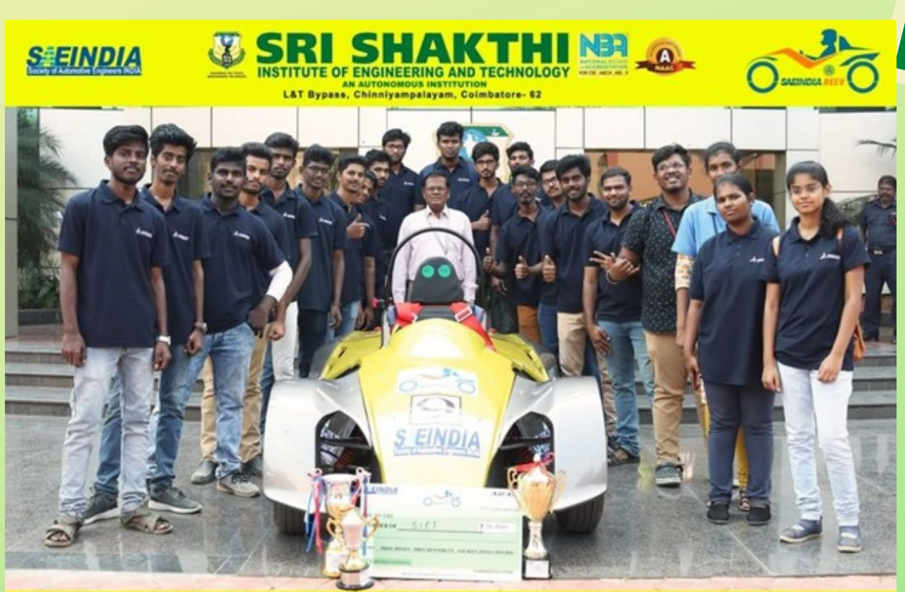
TEAM de'Rapacious Caster

SAE India have first time conducted a hybrid vehicle making competition called REEV (Range Extended Electric Vehicle) in India, under the guidance of General Motors and our college team De'Rapacious Caster has placed overall 2nd in the competition and our car has emerged as the best vehicle throughout the competition.